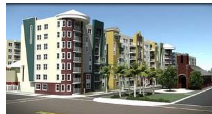
Bessolo Design Group Tempo at Encore rendering